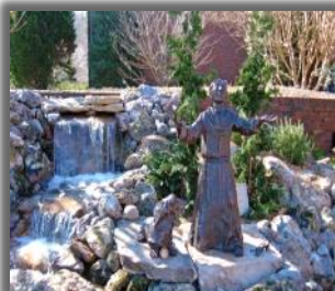
The St. Francis Garden Outdoor sculpture and fountain