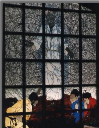
The Transfiguration of the Lord Sanctuary glass art