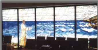
The Jesus Calms the Sea Chapel glass art