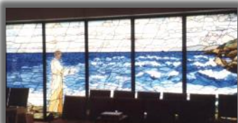
Jesus Calms the Sea Chapel glass art